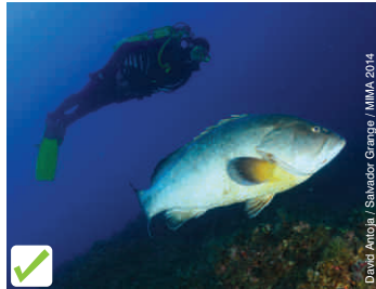
David Antoja / Salvador Grange / MIMA 2014

The diversity of fish populations is one of the main assets of its waters. You can observe them without offering them food.