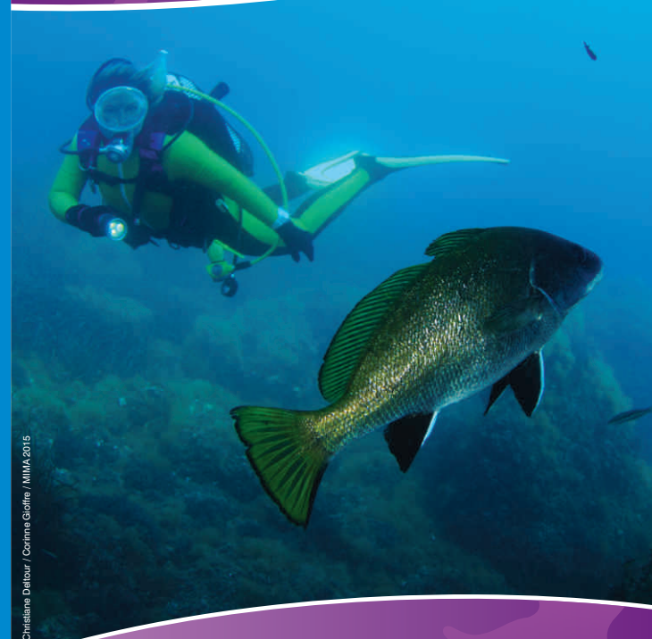
Christiane Delbour / Corinne Goffre / MMA 2015