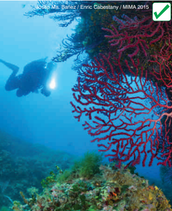
José Ma. Baré / Enric Cabestany / MIMA 2015

The coralline is formed by very fragile, slow-growing species. Contact tends to damage them. Avoid handling them or touching them involuntarily.